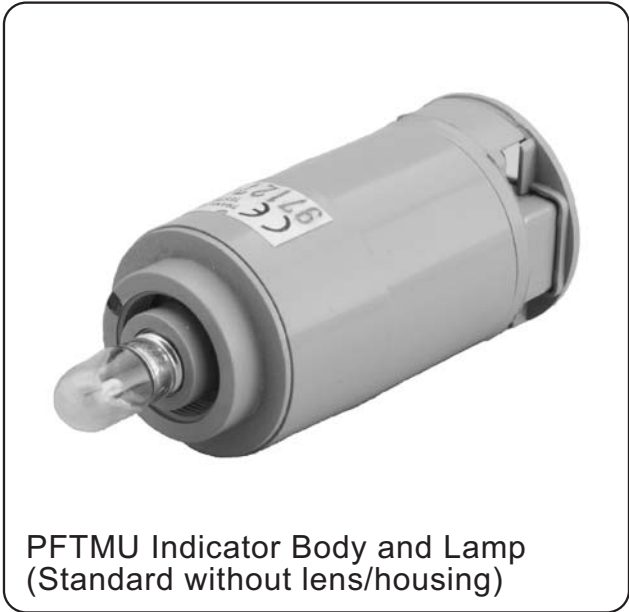
PFTMU Indicator Body and Lamp (Standard without lens/housing)

THIS INDICATOR, WHICH INCORPORATES A RELAY, PROVIDES A WARNING WHEN THE NORMAL CONTROL CIRCUIT POWER SUPPLY FAILS. THE UNIT REQUIRES A PERMANENT LIVE SIGNAL, IF THE CIRCUIT SUPPLY FAILS THE INDICATOR THEN ILLUMINATES OR SOUNDS THE ALARM. THE CONTROL CIRCUIT AT ALL TIMES REMAINS ISOLATED FROM THE PERMANENT LIVE SUPPLY.